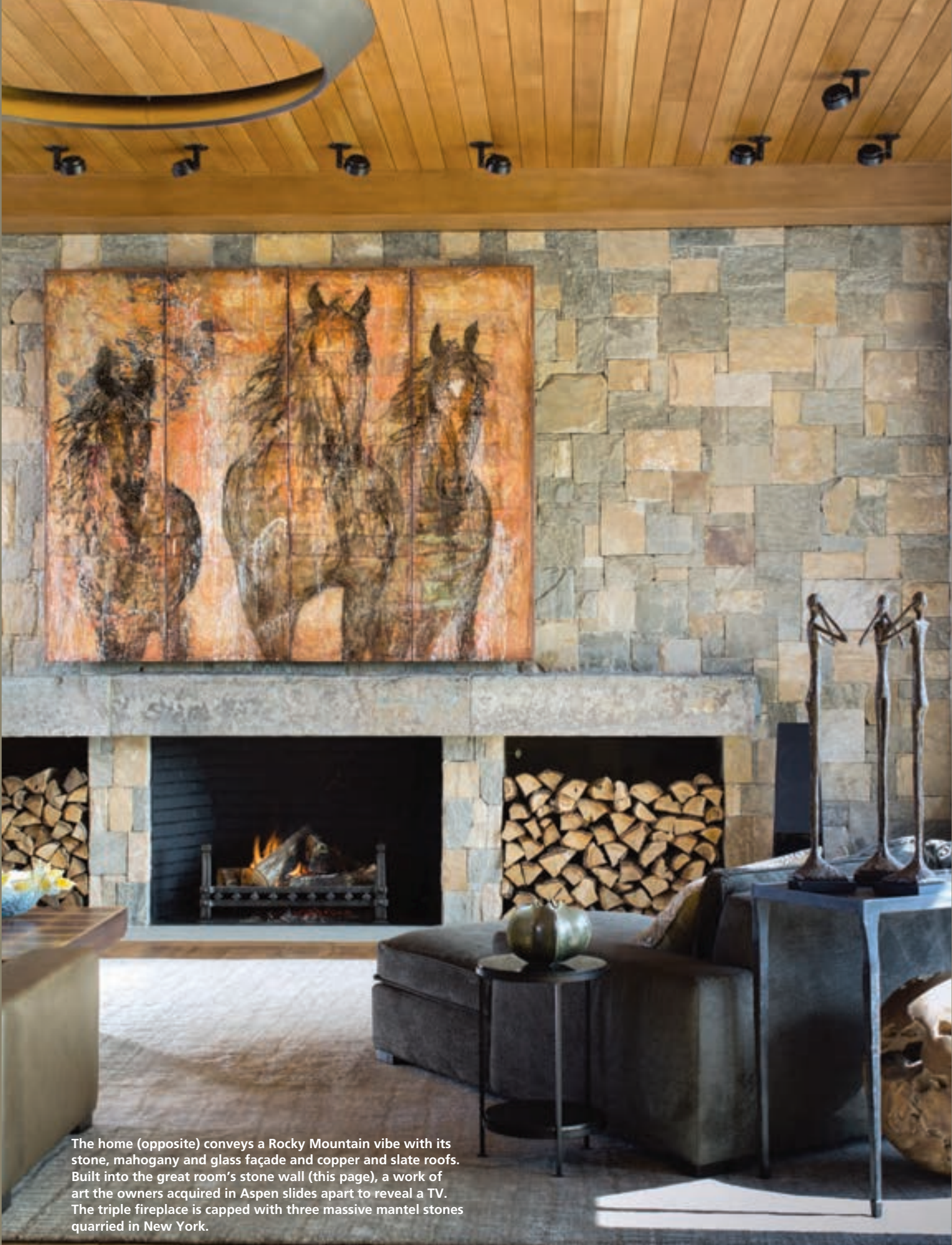
The home (opposite) conveys a Rocky Mountain vibe with its stone, mahogany and glass façade and copper and slate roofs. Built into the great room's stone wall (this page), a work of art the owners acquired in Aspen slides apart to reveal a TV. The triple fireplace is capped with three massive mantel stones quarried in New York.