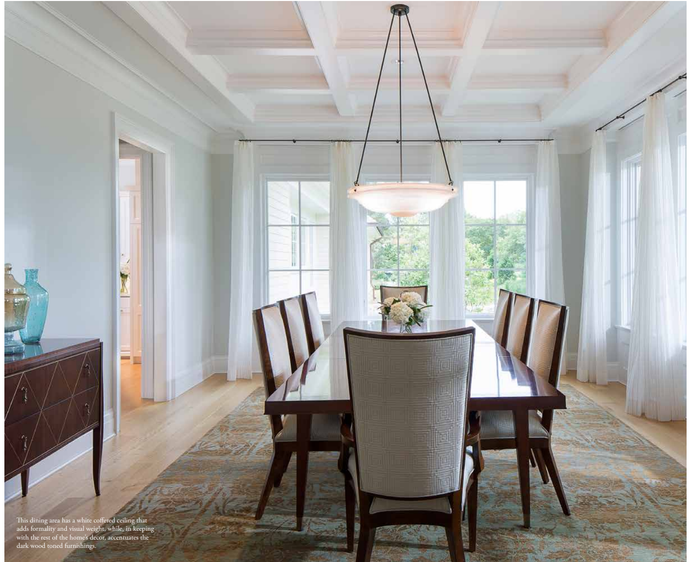
This dining area has a white coffered ceiling that adds formality and visual weight, while, in keeping with the rest of the home's decor, accentuates the dark wood toned furnishings.